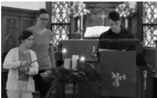
Hoffman Family lighting the Advent candle